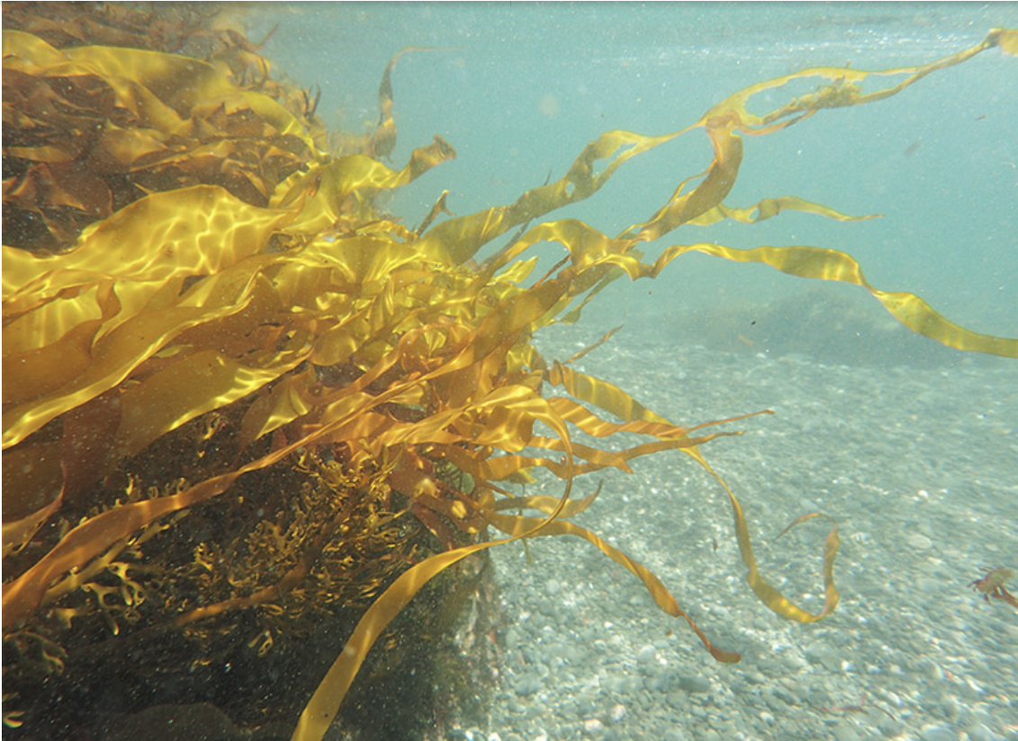
Just one of a series of beautiful underwater photographs by Tina Godbert , taken in the Bay of Islands this summer and submitted to our Festival of Exploration.

In January 2016 the government released " A new Marine Protected Areas Act: Consultation document ". This long-awaited document sets out how the government proposes to reform existing legislation around marine protection - including the 1971 Marine Reserves Act - to create a new approach to marine protection in New Zealand.